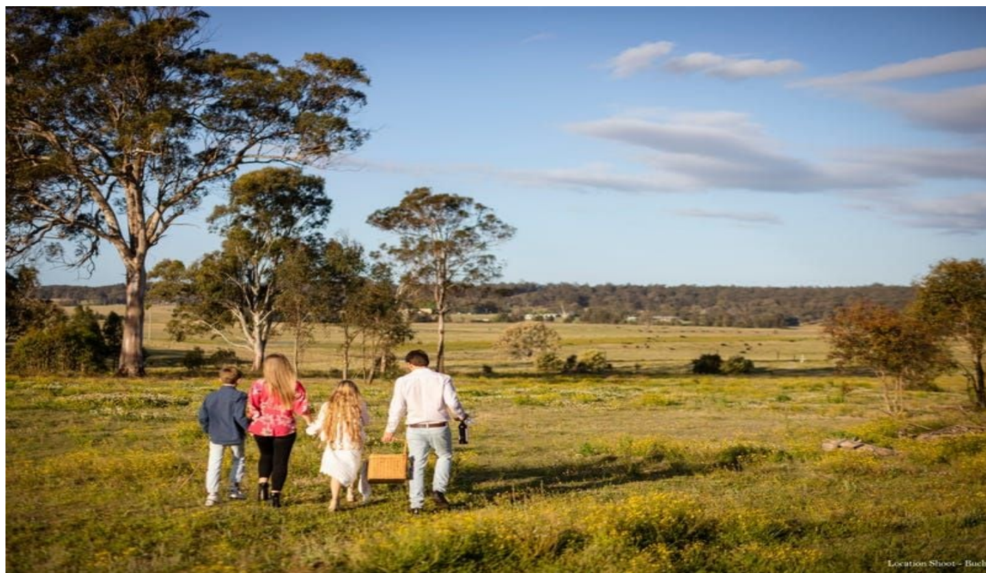
Location Shoot - Bucha