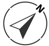
Illustration for identification purposes only, measurements are approximate only and not to scale