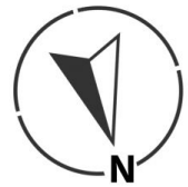
Illustration for identification purposes only, measurements are approximate only and not to scale