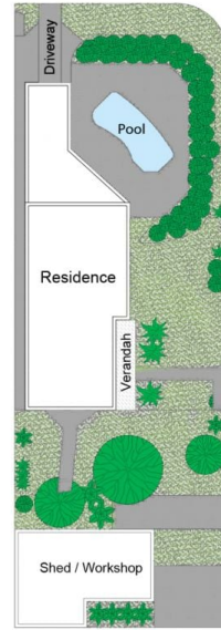
(Site Plan Not To Scale)