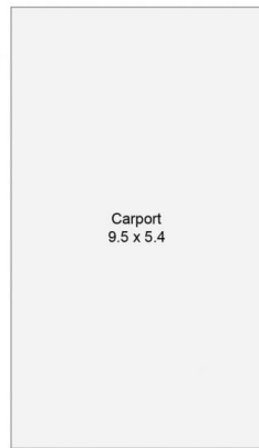
(Not Shown In Actual Location / Orientation)