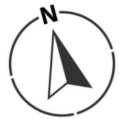
Illustration for identification purposes only, measurements are approximate only and not to scale