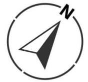
Illustration for identification purposes only, measurements are approximate only and not to scale