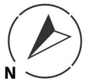
Illustration for identification purposes only, measurements are approximate only and not to scale